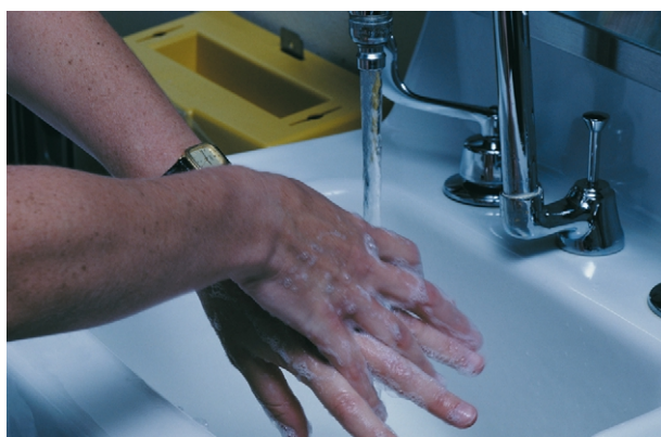
Figure 1. Handwashing, a barrier to transmission of enteric pathogens.

Diarrhoeal diseases are amongst the top three killers of children in the world today. 1 At least 20 viral, bacterial, and protozoan enteric pathogens, including Salmonella spp , Shigella spp , Vibrio cholerae , and rotavirus, multiply in the human gut, exit in excreta, and transit through the environment, causing diarrhoea in new hosts. Because diarrhoeal diseases are of faecal origin, interventions that prevent faecal material entering the domestic environment of the susceptible child are likely to be of greatest significance for public health. 2 The key primary barriers to the transmission of enteric pathogens are safe stool disposal and adequate handwashing (figure 1), especially after contact with faecal material during anal cleansing of adults and children. 3 Hands serve as vectors, transmitting pathogens to foodstuffs and drinks and to the mouths of susceptible hosts. In a 1997 review Huttly quoted five studies on handwashing with a median reduction in diarrhoea incidence of 35%. 4