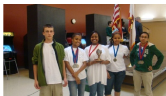
Team #36 - 2 nd Place Overall HS Winner