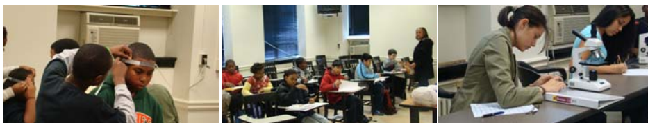
Saturday Academy Students in Action!