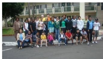
UNC Chapel Hill NC-MSEN Pre-College Program (PCP) NSD Team