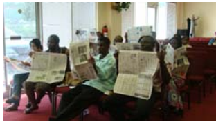
Church members working on newspaper folding challenge

UNC Chapel Hill NC-MSEN Pre-College Program staff was invited to The Church of Pentecost, USA Inc. to talk to students about going and staying in college. Most of the students were from Ghana. We did several hands-on activities to encourage students to pursue more STEM.