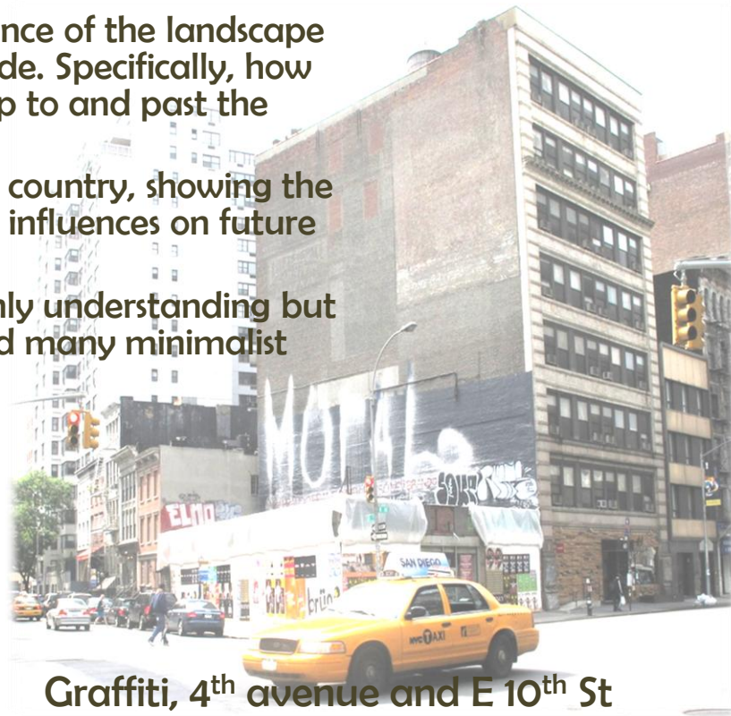
Graffiti, 4 th avenue and E 10 th St