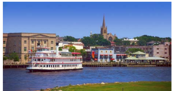
Visit the Historic Riverwalk