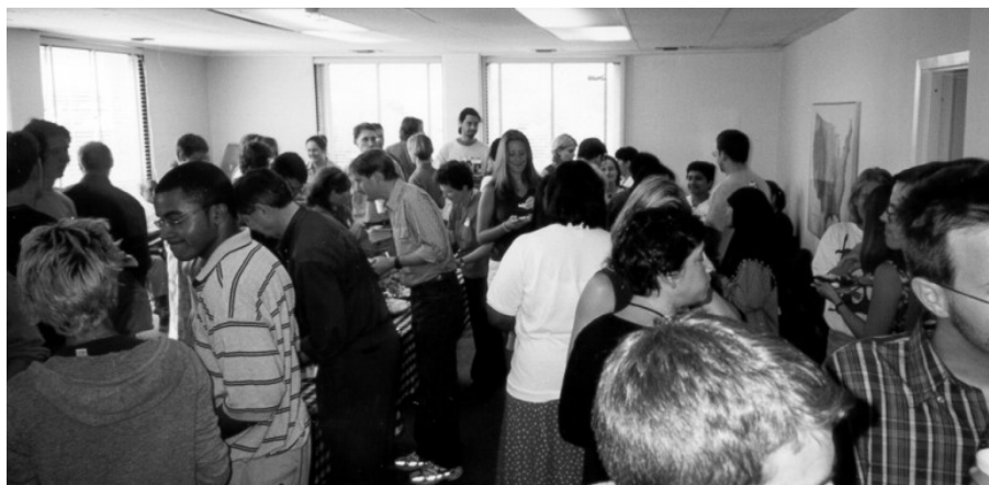
Past, present and future talent assemble at the annual CPC Trainee luncheon

Relationships between land development patterns and welfare measures