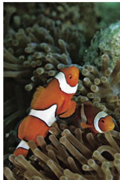
Proc. Natl. Acad. Sci. USA

CORAL REEFS may be degrading from ocean acidification, but the ability of tiny calcifying phytoplankton called coccolithophores to grow in high-CO 2 seawater demonstrates that the marine response to ocean acidification is not uniform. These calcifying organisms build their skeletons by forming crystals of calcium carbonate, and coccolithophores alone produce roughly one-third of the calcium carbonate in today's ocean. M.